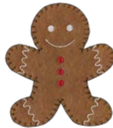
hdhc-15 5.7" W x 6.5" H