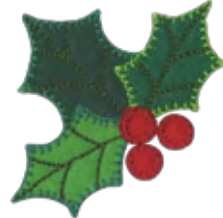
hdhc-7 5.7" W x 5.7" H