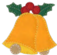
hdhc-17 5.7" W x 5.7" H