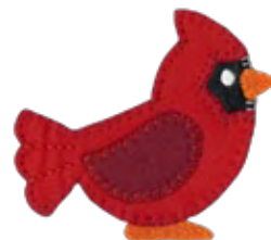
hdhc-11 6.4" W x 5.7" H