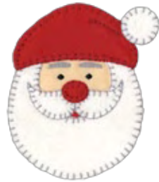
hdhc-1 5.6" W x 6.7" H