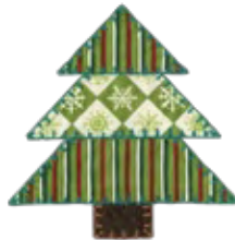
hdhc-2 5.7" W x 5.8" H