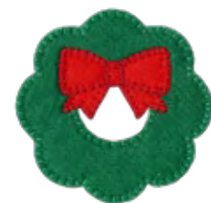
hdhc-8 5.7" W x 5.7" H