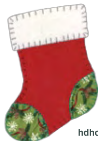
hdhc-4 5.4" W x 7.7" H