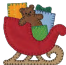
hdhc-18 5.7" W x 5.7" H