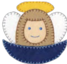
hdhc-13 5.8" W x 5.7" H