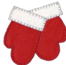
hdhc-3 5.7" W x 5.7" H