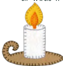
hdhc-6 5.7" W x 6.1" H