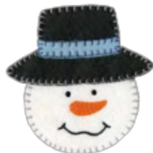
hdhc-5 5.6" W x 5.7" H