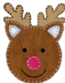
hdhc-10 5.3" W x 7.0" H