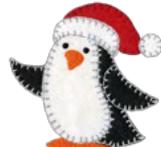
hdhc-12 5.9" W x 5.7" H