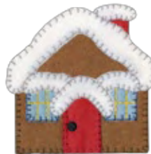
hdhc-19 5.7" W x 5.7" H