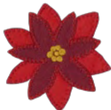
hdhc-9 5.7" W x 5.8" H