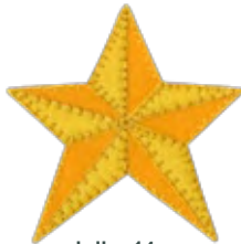
hdhc-14 5.7" W x 5.8" H