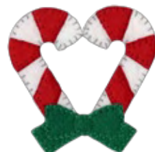
hdhc-16 5.7" W x 5.7" H