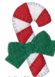
hdhc-20 4.7" W x 7.0" H

Stitched Designs Numbers: hdhc-21 through hdhc-40