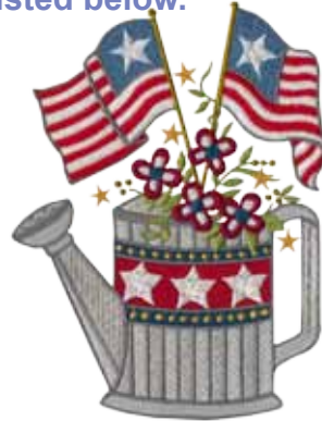
hdam-18 5.7" w x 7.7" h hdam-18b 4.8" w x 6.4" h