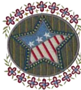
hdam-11 5.7" w x 6.5" h hdam-11b 4.7" w x 5.3" h