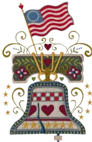
hdam-4 6.0" w x 9.5" h