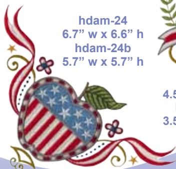
hdam-24 6.7" w x 6.6" h hdam-24b 5.7" w x 5.7" h