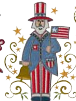
hdam-19 4.8" w x 6.6" h