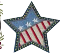
hdam-12 4.8" w x 4.3" h