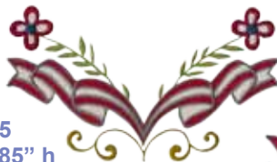
hdam-5 6.7" w x 3.85" h