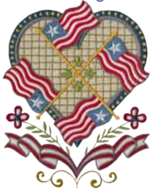
hdam-3 5.7" w x 7.4" h

38 Designs total- for the 5x7 & jumbo hoops. Some designs in two sizes; sizes listed below.