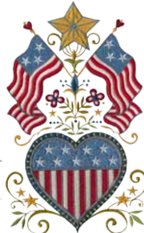
hdam-1 5.7" w x 9.3" h