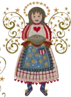
hdam-13 4.7" w x 6.7" h