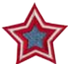
hdam-9 2.6" w x 2.5" h