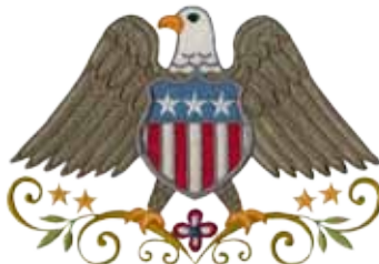
hdam-14 6.8" w x 4.7" h