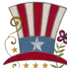
hdam-20 4.5" w x 4.5" h hdam-20b 3.6" w x 3.6" h