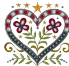
hdam-21 4.5" w x 4.5" h hdam-21b 3.6" w x 3.6" h