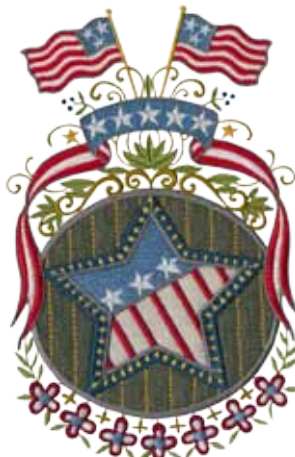
hdam-10 5.7" w x 9.2" h