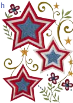
hdam-2 4.7" w x 6.4" h