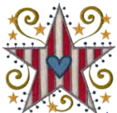
hdam-16 4.5" w x 4.6" h hdam-16b 3.7" w x 3.7" h hdam-17 4.7" w x 4.7" h hdam-17b 3.7" w x 3.7" h