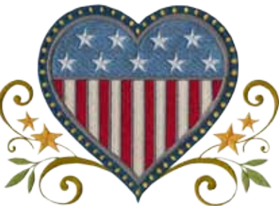
hdam-8 8.0" w x 5.7" h hdam-8b 6.6" w x 4.7" h