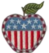
hdam-15 3.0" w x 3.4" h