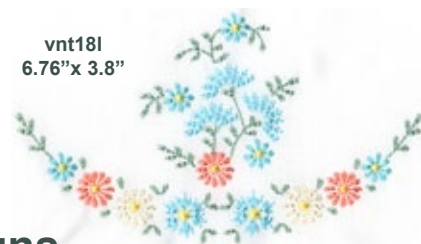
vnt18l 6.76"x 3.8"