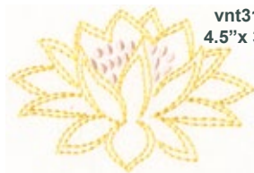
vnt31 4.5"x 3"