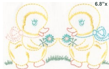
vnt29 6.8"x 4.2"