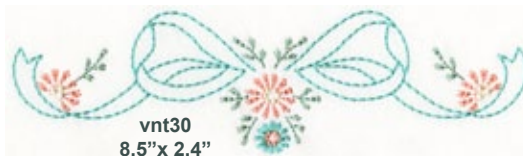
vnt30 8.5"x 2.4"