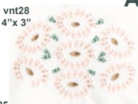
vnt28 4"x 3"