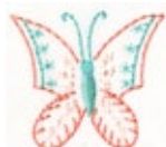
vnt32 2.3"x 2"