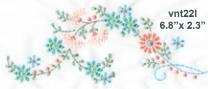
vnt22l 6.8"x 2.3"