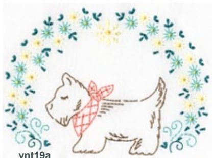
vnt19a 8"x 5.8" vnt19b 6.6"x4.8"