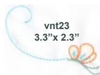
vnt23 3.3"x 2.3"