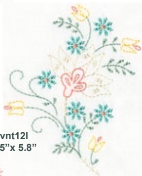
vnt12l 4.5"x 5.8"