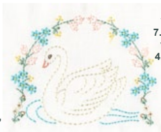
vnt15a 7.6"x 5.8" vnt15b 4.8"x3.6"