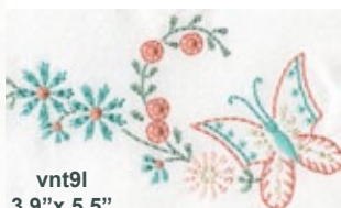
vnt9l 3.9"x 5.5"