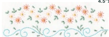
vnt20l 6.76"x 2.3"