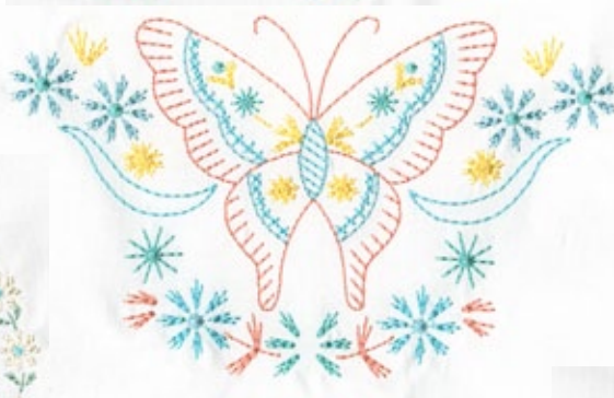
vnt1a 9.2"x 5.5" vnt1b 6.75"x4"