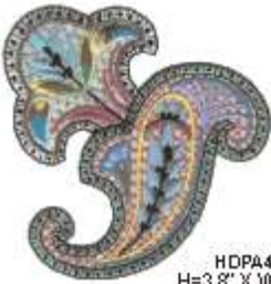
HDP A40 H=3.8" X W= 3.8"