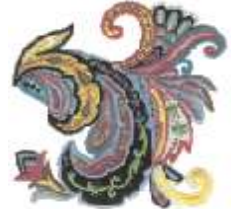
HDP A39 H=4.8" X W= 4.9" HDP A39AH =5.8" X W= 5.9"