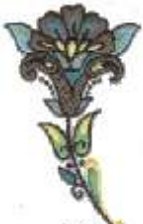
HDP A5 H=5.0" X W= 3.0"