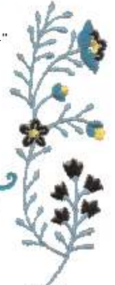
HDP A20 H=5.0" X W= 1.7"