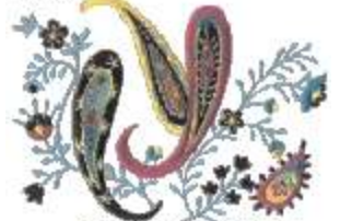
HDP A16 H=4.9" X W= 6.6"