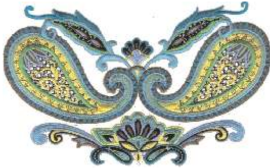
HDP A6 H=5.9" X W= 9.7"