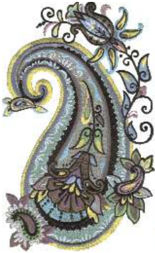
HDP A1 H=9.6" X W= 5.9" 2 Sizes HDP A1B H=11.25" X W= 6.9"

44 designs all for the 4x4, 5x7 and jumbo hoop