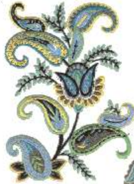
HDP A10 H=6.8" X W= 4.9"