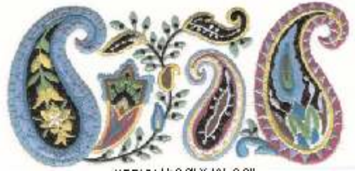
HDP A21 H=3.3" X W= 8.8"