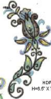
HDP A2: H=6.5" X W= 3.4"