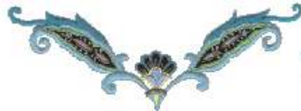
HDP A9 H=2.5" X W= 6.9"