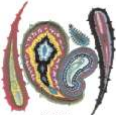
HDP A36 H=3.8" X W= 3.8"