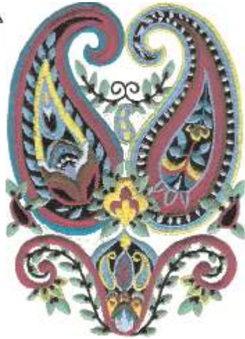
HDP A41 H=6.8" X W= 4.9"