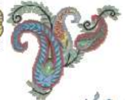
HDP A32 H=2.8" X W= 3.4"