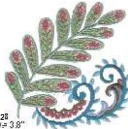
HDP A28 H=3.8" X W= 3.8"