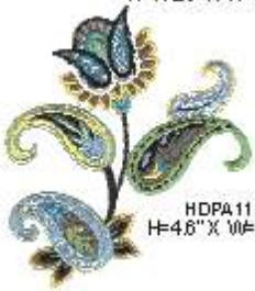
HDP A11 H=4.6" X W= 4.6"