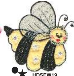
●★ HDSEW19 5.8H X 5.8W