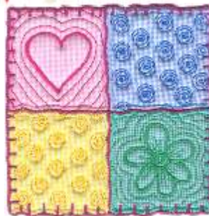
●★ HDSEW15 4.9H X 4.9W