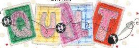
●★ HDSEW22 3.6H X 9.8W