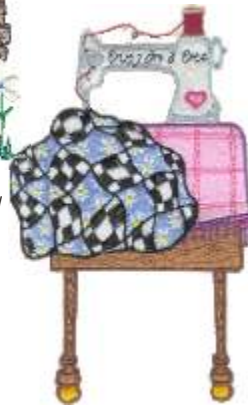
HDSEW31 6.9H X 4.2W