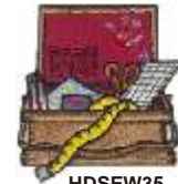
HDSEW35 3.2H X 3.0W