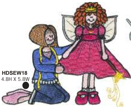
HDSEW18 4.8H X 5.8W

43 Designs total for the 4x4, 5x7, and Jumbo Hoops Designs with a ★ are applique. Designs with a ● come in 2 sizes