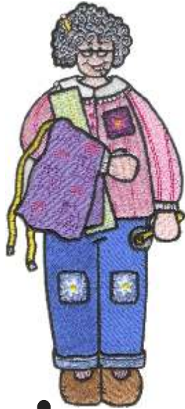
● HDSEW36 6.8 X 3.2W