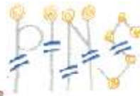
HDSEW30 2.5H X 3.8W