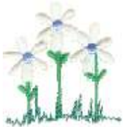
HDSEW26 2.3H X 2.5W