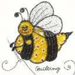
★ HDSEW1 5.3H X 4.8W