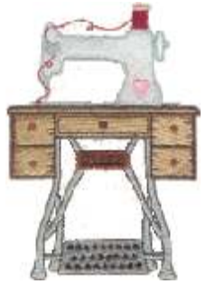
HDSEW6 6.8H X 4.0W