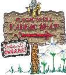
★ HDSEW25 4.9H X 4.5W