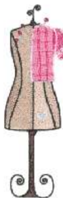
HDSEW4 6.8H X 2.4W