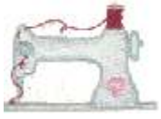
HDSEW7 2.3H X 3.3W