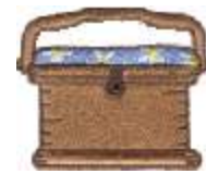
HDSEW34 2.8H X 3.3W