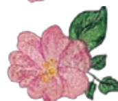
FS-BL19 3.0" W - 2.6" H