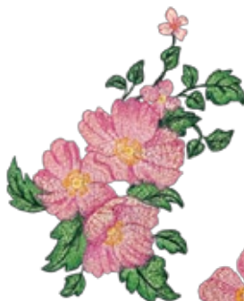
FS-BL3 5.8" W - 7.2" H