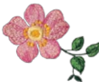
FS-BL22 3.8" W - 3.2" H