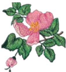
FS-BL25 4.5" W - 3.8" H