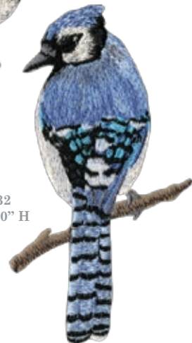
FS-BL32 2.9" W - 5.0" H