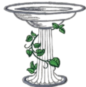
FS-BL21 4.7" W - 5.0" H