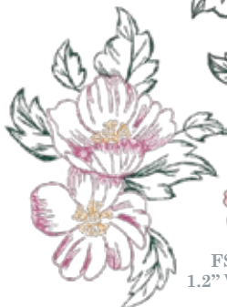
FS-BL13 3.9" W - 5.5" H