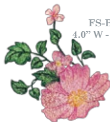
FS-BL5 4.0" W - 4.5" H