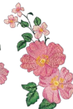
FS-BL20 5.0" W - 7.8" H