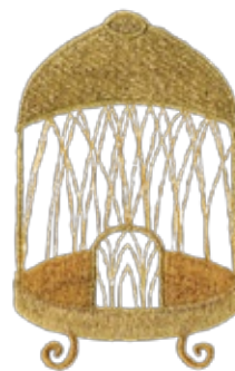
FS-BL30 2.8" W - 4.8" H