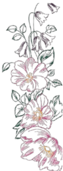
FS-BL15 3.5" W - 9.5" H