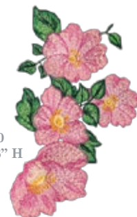
FS-BL10 3.9" W - 6.8" H