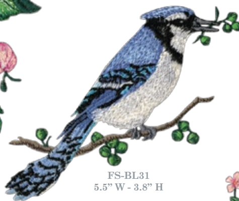
FS-BL31 5.5" W - 3.8" H