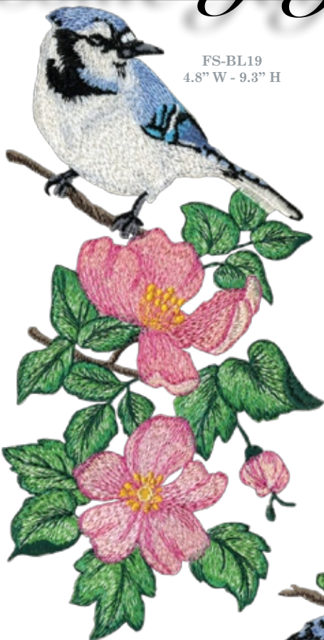
FS-BL19 4.8" W - 9.3" H