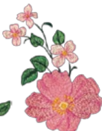
FS-BL26 4.5" W - 3.8" H