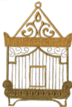
FS-BL29 3.4" W - 5.0" H