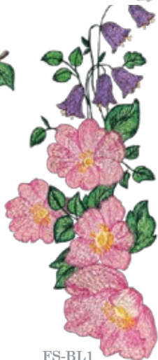
FS-BL1 4.0" W - 9.5" H