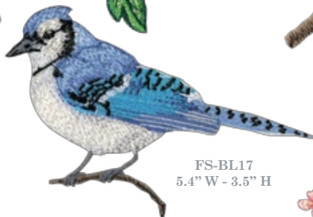
FS-BL17 5.4" W - 3.5" H