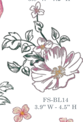
FS-BL14 3.9" W - 4.5" H