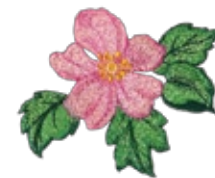
FS-BL24 4.5" W - 3.8" H