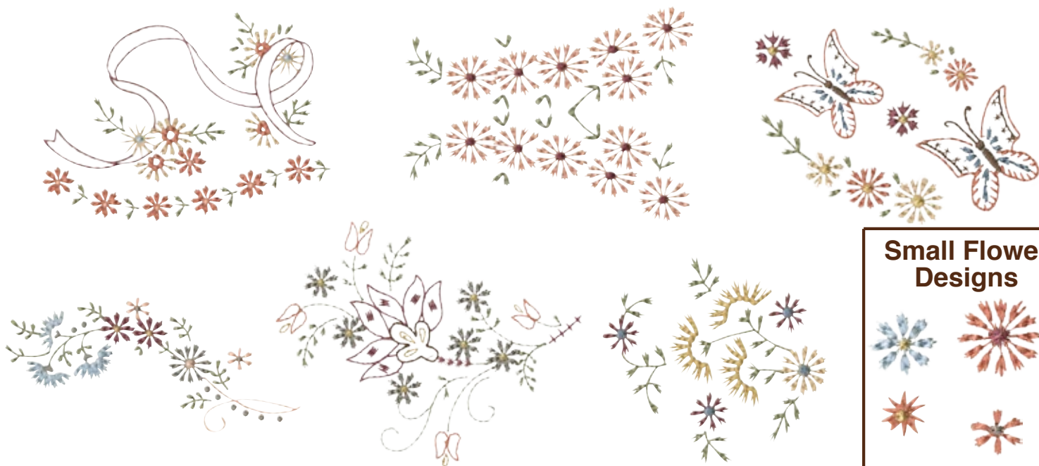
Small Flower Designs

Each of the side pieces has a left and right side. The design ending with a number is the left side and the design ending with a B is the right side.