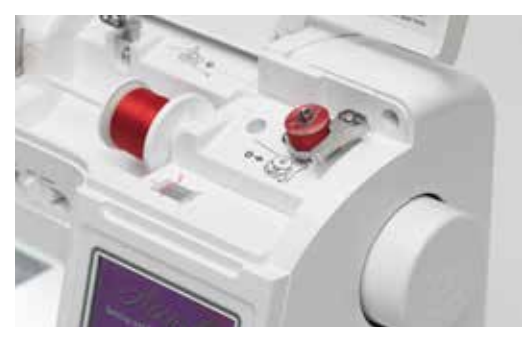
Quick-Set, Bobbin Winder The quick-set winder holds the thread in place and stops automatically when the bobbin is full.