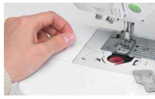
Quick-Set, Top- Loading Bobbin Simply drop your bobbin in the machine, pull your thread through the slot, and let your machine do the rest of the work.