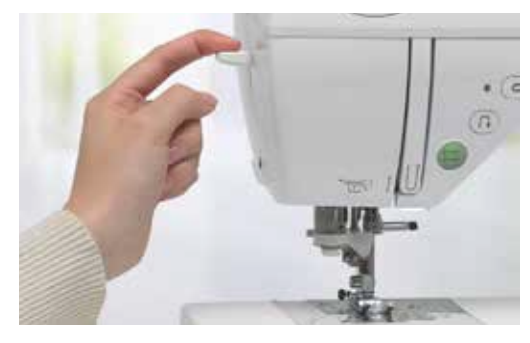
Advanced Needle Threader With just a few simple motions, your needle is threaded and ready to use - it's so easy, you can do it with one hand!