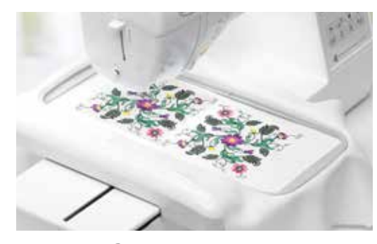
Multi-Position Embroidery Hoop Embroider larger designs without having to re-hoop your fabric with the 5" x 12" Multi-Position hoop.