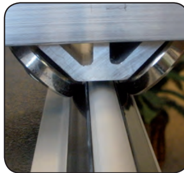
PRECISION-GLIDE ALUMINUM TRACK SYSTEM AVAILABLE

SEE YOUR TRAINED HQ REPRESENTATIVE FOR DETAILS.