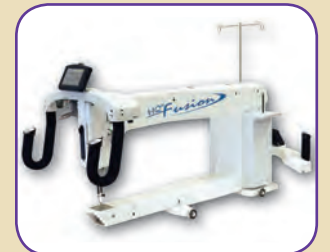
HQ 24 FUSION®