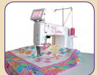
HQ SWEET SIXTEEN® Sit-down