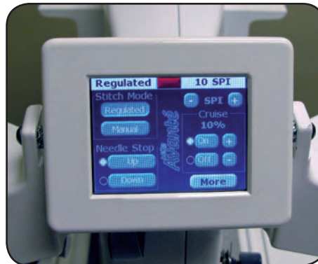
COLOR TOUCH-SCREEN ON FRONT AND BACK HANDLEBARS