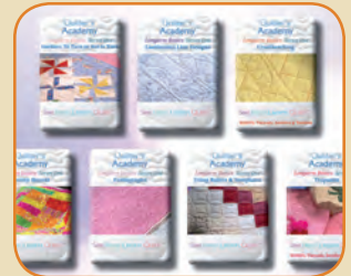
Quilters Academy® DVD SERIES