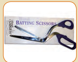
HQ BATTING SCISSORS