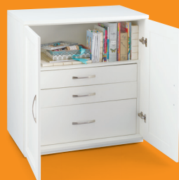
3-DRAWER SUPPLY CABINET