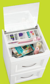
MOBILE NOTIONS CART