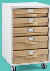
MOBILE PROJECT STORAGE