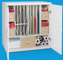
MAT & HOOP CABINET