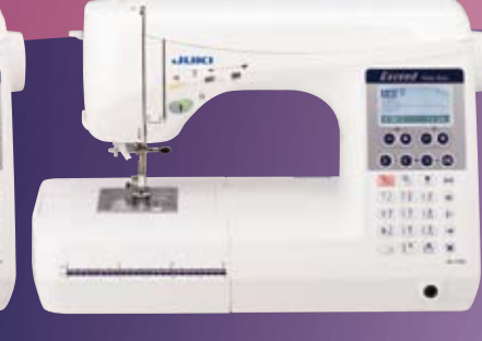
Exceed Home Deco HZL-F300