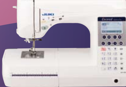
Exceed Quilt & Pro HZL-F400