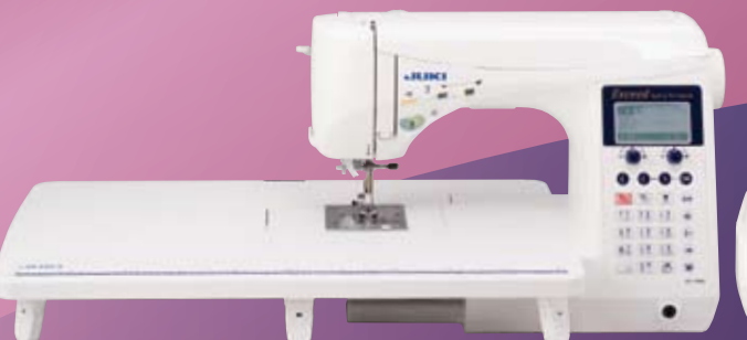
Exceed Quilt & Pro Special HZL-F600

Now it is possible to adjust the cutting