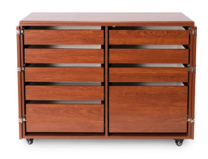
Dingo II Cutting Table

Kangaroo sewing cabinet - check! Now complete your studio with Kangaroo storage and cutting furniture, specially designed to complement your primary workstation. With extra storage and workspace, you can customize your sewing room to be stylish, comfortable, and even more productive!