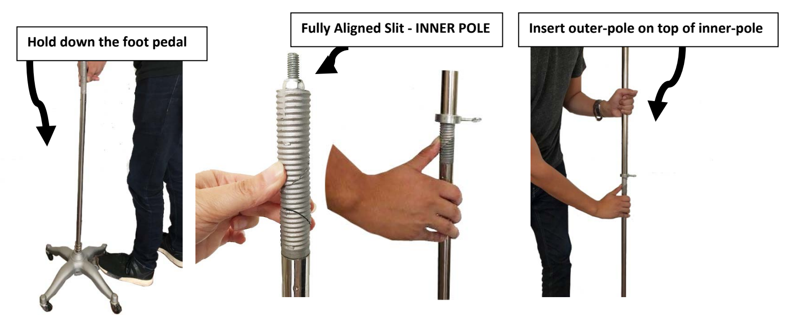
Step 5: Gently insert the dress form over the outer pole and secure the dress form.

Step 4: Hold down the foot pedal while you use one hand to manually align the "slits" on the top of the inner pole. As you continue to hold down the foot pedal use your other hand to place the outer pole over the inner pole once aligned.