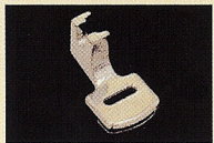
Gathering Foot and