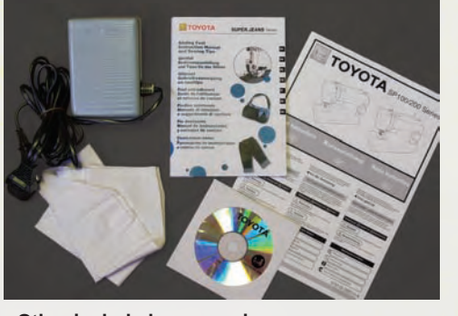
Other included accessories *Dust cover *Electronic foot controller *Quick Guide instruction manual *CD manual *Gliding Foot Instruction manual and Sewing tips

*Blind hem foot *Buttonhole foot *Plastic bobbin (x 2) *Spool cap *Buttonhole cutter *Quilting guide *Screw driver for needle plate