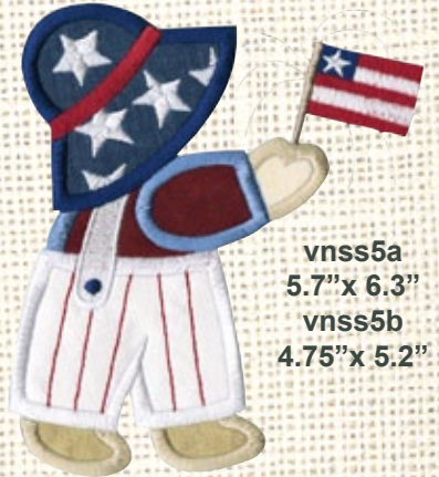
vnss5a 5.7"x 6.3" vnss5b 4.75"x 5.2"