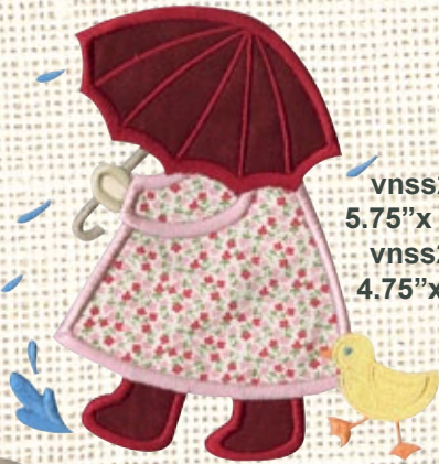
vnss2a 5.75"x 6.1" vnss2b 4.75"x 5"