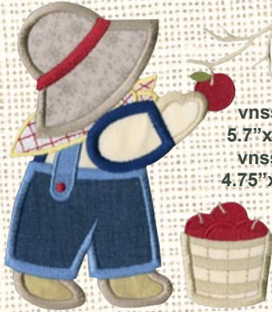
vnss7a 5.7"x 6.4" vnss7b 4.75"x 5.3"