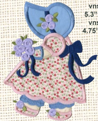
vnss4a 5.3"x 6.8" vnss4b 4.75"x 6.1"