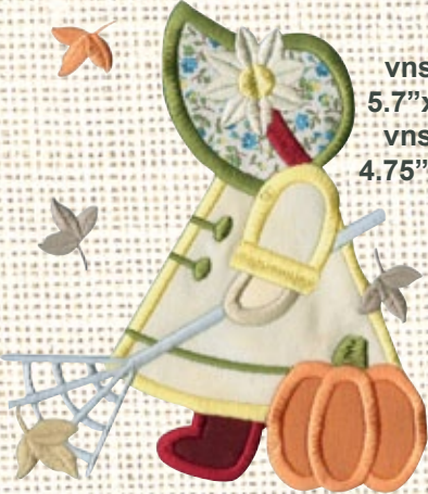
vnss8a 5.7"x 6.4" vnss8b 4.75"x 5.5"