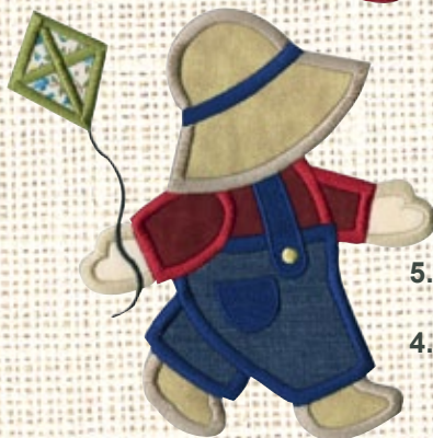
vnss1a 5.75"x 5.8" vnss1b 4.75"x 4.8"