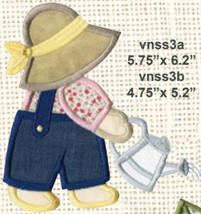
vnss3a 5.75"x 6.2" vnss3b 4.75"x 5.2"