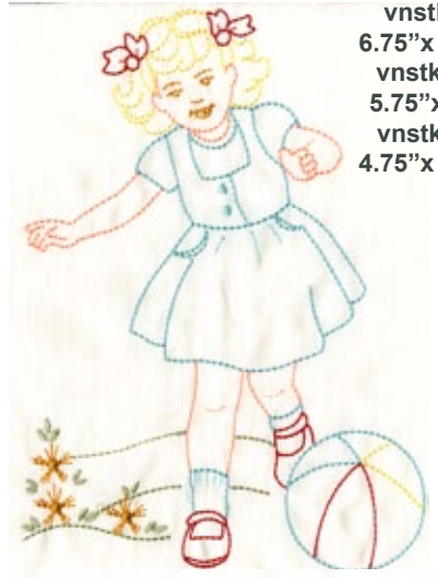
vnstk5 6.75" x 9.3" vnstk5b 5.75" x 8" vnstk5c 4.75" x 6.6"