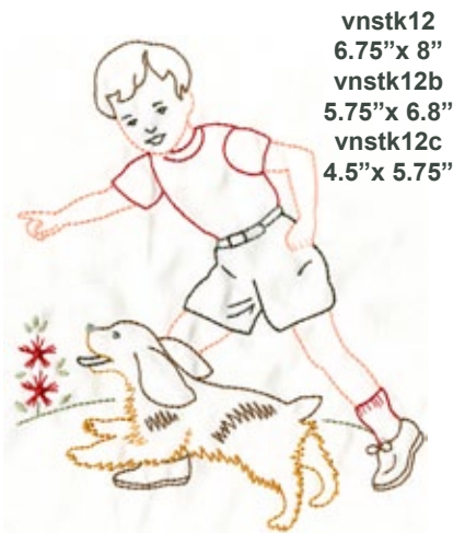
vnstk12 6.75" x 8" vnstk12b 5.75" x 6.8" vnstk12c 4.5" x 5.75"