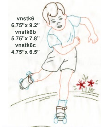
vnstk6 6.75" x 9.2" vnstk6b 5.75" x 7.8" vnstk6c 4.75" x 6.5"