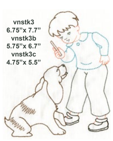
vnstk3 6.75" x 7.7" vnstk3b 5.75" x 6.7" vnstk3c 4.75" x 5.5"