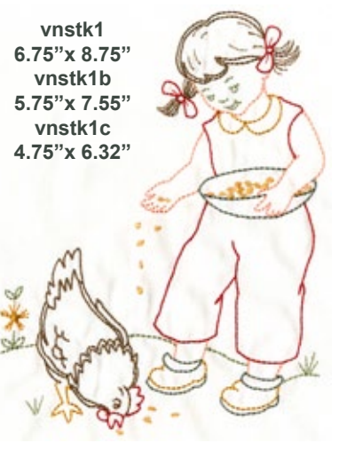
vnstk1 6.75" x 8.75" vnstk1b 5.75" x 7.55" vnstk1c 4.75" x 6.32"