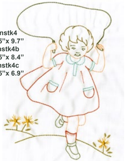
vnstk4 6.75" x 9.7" vnstk4b 5.75" x 8.4" vnstk4c 4.75" x 6.9"