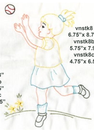
vnstk8 6.75" x 8.75" vnstk8b 5.75" x 7.9" vnstk8c 4.75" x 6.5"