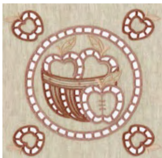
Medallion- NNAC15 Corner design- NNAC16