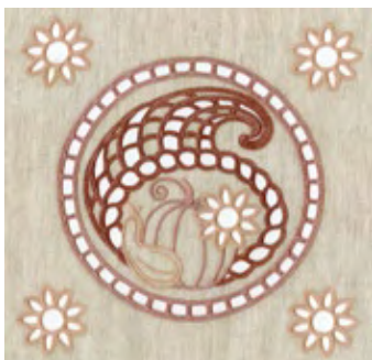
Medallion- NNAC7 Corner design- NNAC8