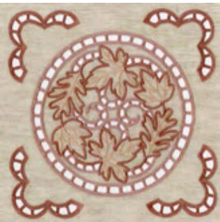
Medallion- NNAC13 Corner design- NNAC14