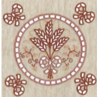
Medallion- NNAC9 Corner design- NNAC10