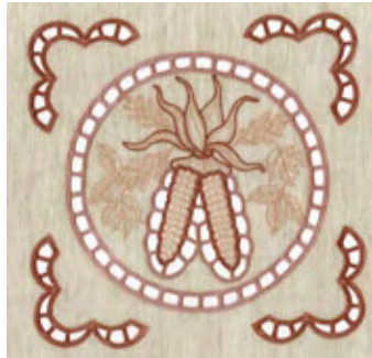
Medallion- NNAC3 Corner design- NNAC4