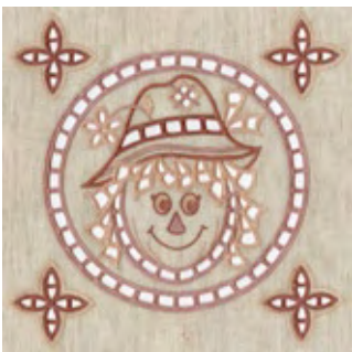
Medallion- NNAC11 Corner design- NNAC12