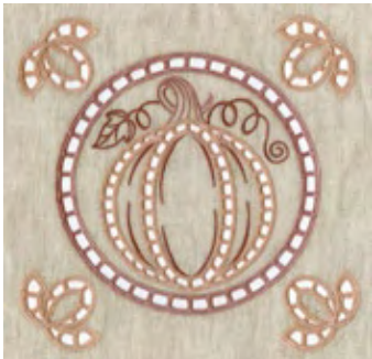
Medallion- NNAC1 Corner design- NNAC2