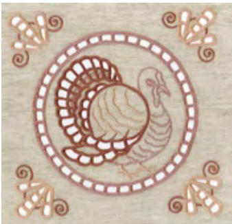
Medallion- NNAC5 Corner design- NNAC6