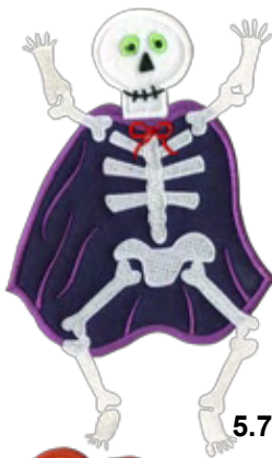
hal-8 5.7" W - 9.5" H