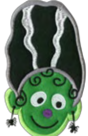
hal-12 3.87" W - 6.5" H