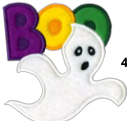
hal-20 5.7" W - 5.8" H