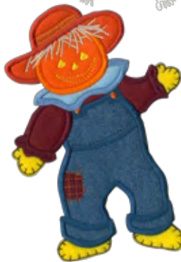
hal-2 5.7" W - 8.5" H