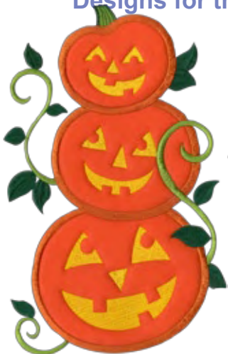
hal-16 6.7" W - 11.1" H

Designs for the 4"x4" 5"x7" and jumbo hoop. Note: Not all designs shown here.