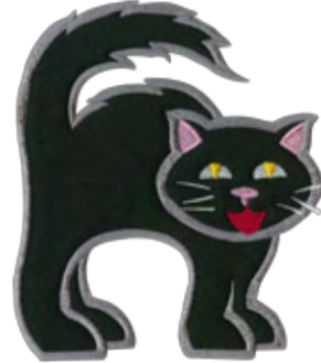
hal-5 5.8" W - 7.9" H