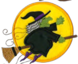
hal-23 6.0" W - 5.7" H