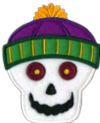
hal-21 4.5" W - 5.6" H