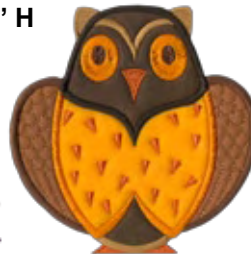
hal-17 5.7" W - 5.8" H