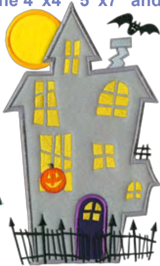
hal-7 6.7" W - 11.1" H