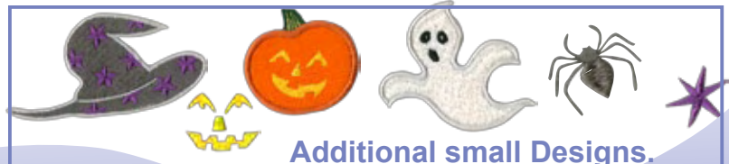
Additional small Designs.

visit our website at www.anita-goodesign.com