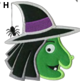
hal-10 5.7" W - 6.1" H