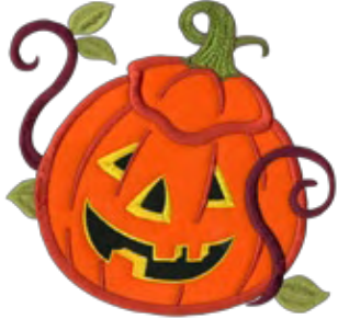
hal-3 6.7" W - 6.4" H