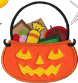
hal-19 5.7" W - 6.2" H