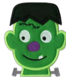
hal-13 4.8" W - 5.7" H