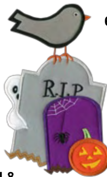
hal-18 6.3" W - 11.4" H