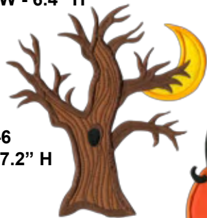
hal-6 6.7" W - 7.2" H