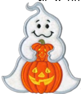
hal-1 5.7" W - 6.8" H