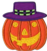
hal-22 4.3" W - 4.9" H