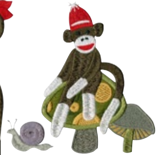
SM12 4.7"x 4.8"