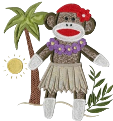
SM4A 5.8"x 5.8" SM4B 4.8"x 4.8"