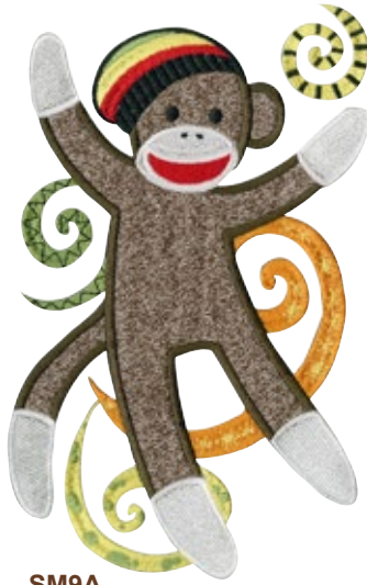
SM9A 6.4"x 10.6" SM9B 5.8"x 9.6"