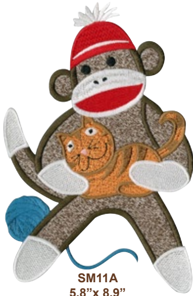
SM11A 5.8"x 8.9" SM11B 4.4"x 6.8"

19 designs total for the 5"x 5", 5"x 7", and 6"x 10" hoops.