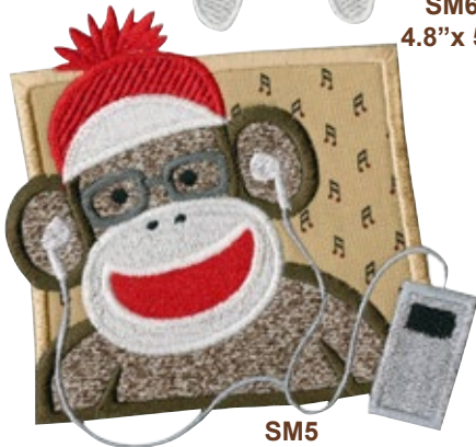
SM5 5"x 4.8"