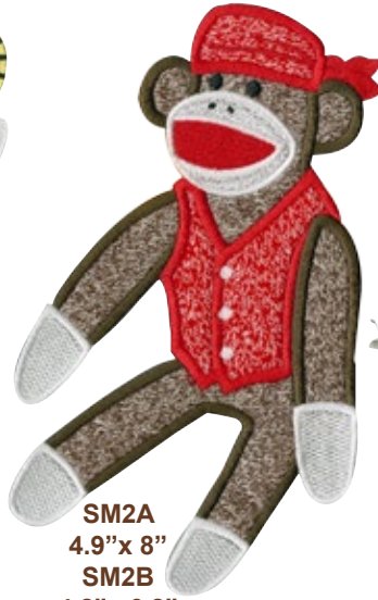
SM2A 4.9"x 8" SM2B 4.2"x 6.8"