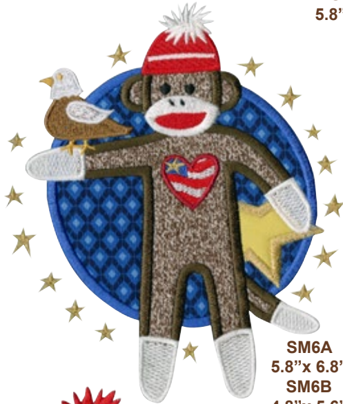
SM6A 5.8"x 6.8" SM6B 4.8"x 5.6"