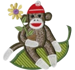
SM6A 4.8"x 4.8"