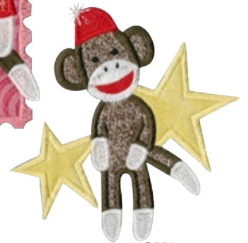
SM3 4.8"x 5"