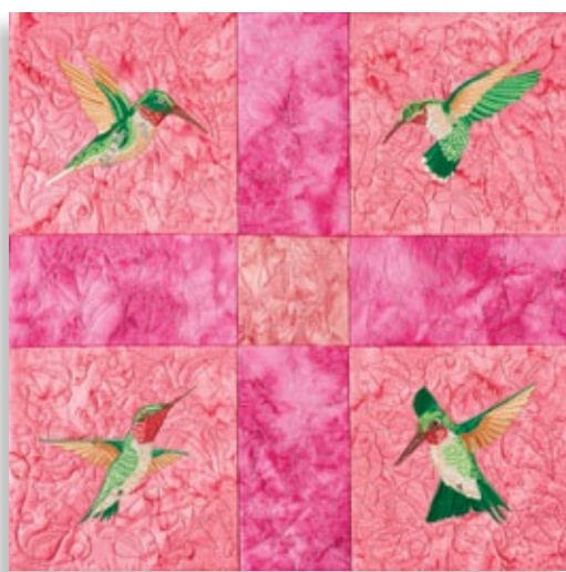
Floral Foundations + Hummingbirds