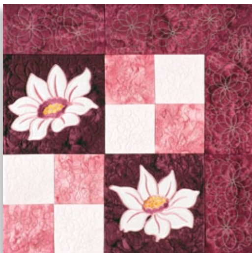
Floral Foundations + Strawberry Blossoms

Each "Quilt" below was created using the "Floral Foundations" blocks combined with "other embroidery design collections".