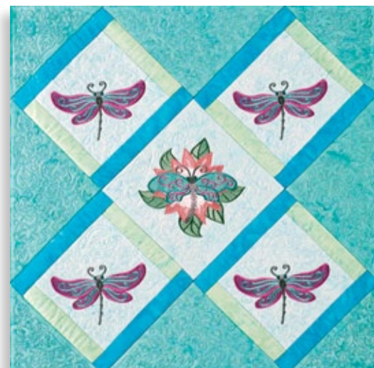
Floral Foundations + Dragonflies