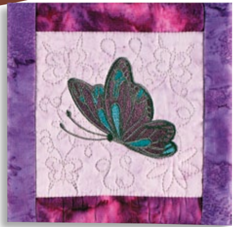
Butterflies (Mini Collection)

This collection consists of quilt blocks that will easily merge with your existing designs to create beautiful quilts in your machine without using any software. You simply open the desired background, merge your existing embroidery design and stitch the block!