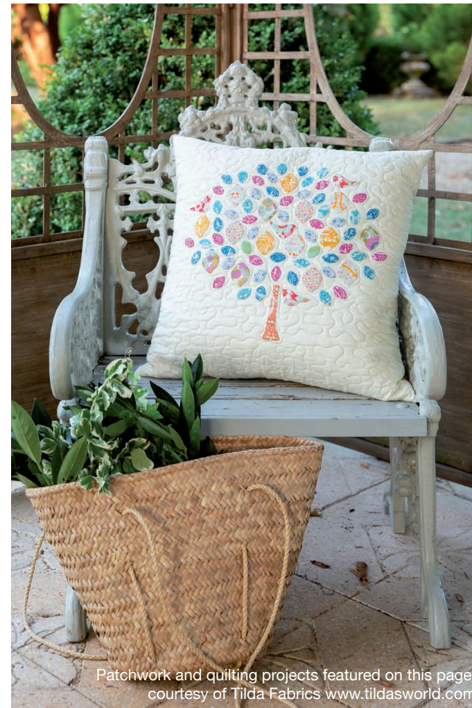
Patchwork and quilting projects featured on this page: courtesy of Tilda Fabrics www.tildasworld.com