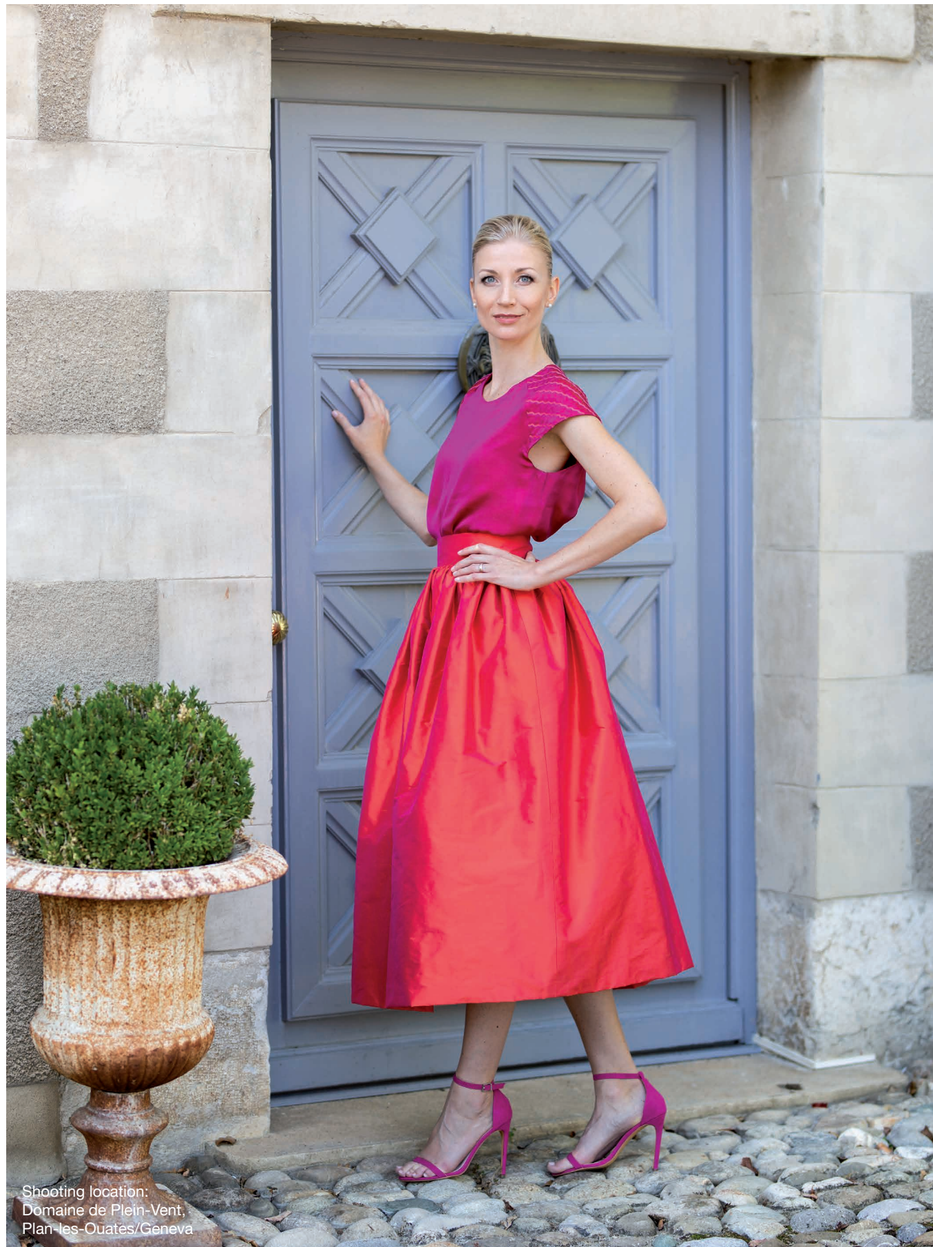
Shooting location: Domaine de Plein-Vent, Plan-les-Ouates/Geneva