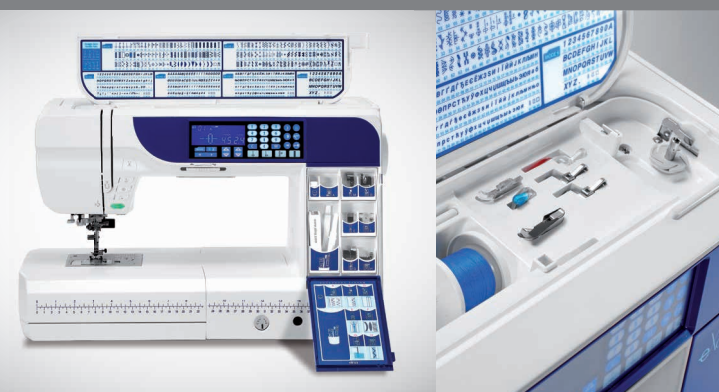
Provided as part of the standard accessory package of all our eXcellence models. for expanded workspace with large sewing projects.

Three storage areas, including the elna-exclusive accessory side-case, help you organize the many presser feet and tools provided in the kit of standard accessories.