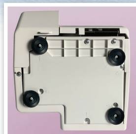
HANENITE™ RUBBERFEET REDUCE VIBRATION