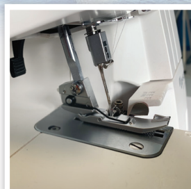
EIGHT PIECE FEED DOG FOR IMPROVED FEEDING