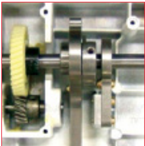
8 Ball Bearings