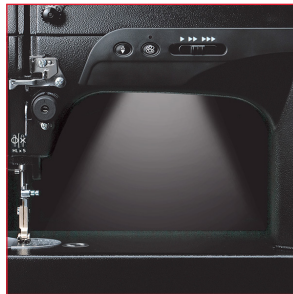
Six LED Lights