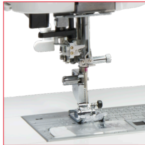
Superior Needle Threader & Improved Sewing Field View