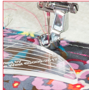
Ruler Quilting Function