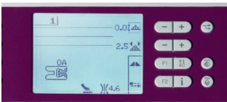
All information at a glance – everything is so clear.