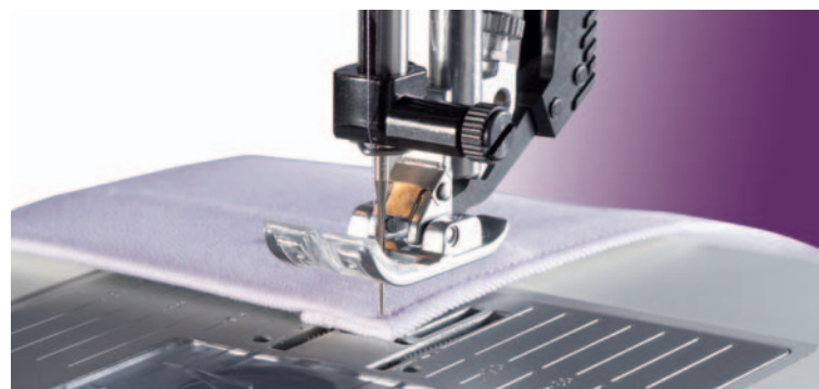
Like magic! Raises the presser foot automatically.