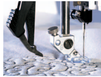
Beautiful free-motion quilting, stippling or thread painting.

The bobbin thread sensor alerts you when the bobbin thread is running low.