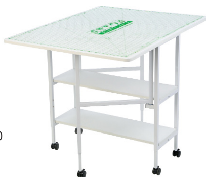
Dixie Cutting Table

Arrow sewing cabinet - check! Now add even more convenience to your studio with a dedicated cutting table like Dixie , specially designed to complement your primary Arrow sewing cabinet. Add style, storage and comfort to your growing sewing oasis!