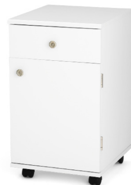
Suzi Storage Cabinet

There can never be too much storage space in your sewing room! Arrow's dedicated storage cabinets are designed for organization and accessibility. Arrow's Suzi , features 4 dedicated storage drawers and comes in Oak and White finishes! Cute and functional!