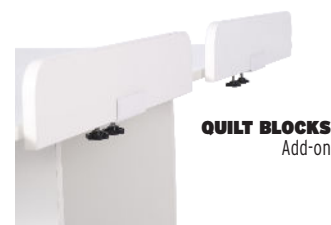
QUILT BLOCKS Add-on