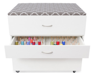
MOD Embroidery Arm Storage Cabinet

Every dream sewing oasis needs its cute, dependable accessories! Add even more convenience with MOD Embroidery Arm Storage Cabinet - featuring dedicated storage for your embroidery machine, a built-in ironing board and expansive thread drawers! Your dream sewing space won't be the same without it!