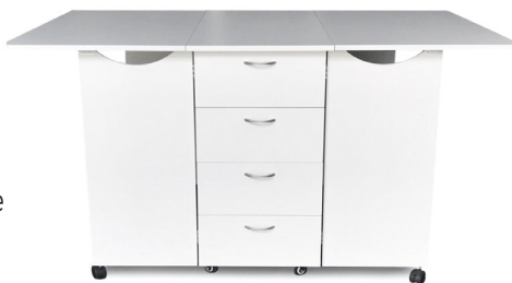
Kookaburra Cutting Table

Kangaroo sewing cabinet - check! Now complete your studio with Kangaroo storage and cutting furniture, specially designed to complement your primary workstation. With extra storage and workspace, you can customize your sewing room to be stylish, comfortable, and even more productive!