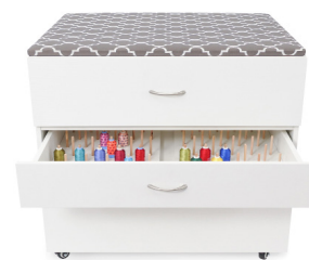
MOD Embroidery Storage Cabinet

Every dream sewing oasis needs its cute, dependable accessories! Add even more convenience with MOD Embroidery Storage Cabinet - featuring dedicated storage for your embroidery machine, a built-in ironing board and expansive thread drawers! Your dream sewing space won't be the same without it!