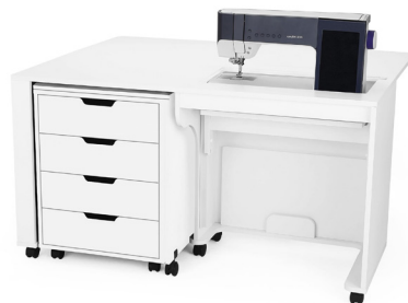
Laverne & Shirley Sewing Cabinet

Sewing cabinets provide comfort, easy set-up, dedicated storage for your machine and notions, different positions for better sewing posture and a spirited environment for crafting. Your machine deserves better than the dining room table! Sew in comfort, sew longer!