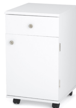
Suzi Storage Cabinet

There can never be too much storage space in your sewing room! Arrow's dedicated storage cabinets are designed for organization and accessibility. Arrow's Suzi , features 4 dedicated storage drawers and comes in Oak and White finishes! Cute and functional!