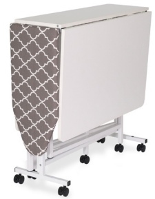
Table Finish: Melamine Laminate