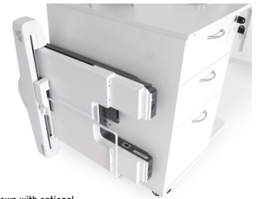
Shown with optional embroidery arm storage rack