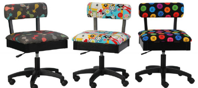
Cat's Meow, Sew Wow Sew Now & Bright Buttons Chairs

The cherry on top of your sewing sundae! Arrow's #1 Rated Height Adjustable Sewing Chair is a must have accessory for your dream sewing room! Cute, comfortable and convenient - our lovable chairs feature vibrant sewing themed patterns, 360° swivel access and lumbar support for long hours at your workstation. Don't look now, but under every seat cushion is a hidden storage compartment to store your notions and patterns! Available in 10 colors to perfectly match your sewing sanctuary!