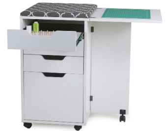
Kiwi Storage Cabinet

Every dream sewing oasis needs its cute, dependable accessories! Add even more convenience with a storage cabinet like Kiwi, featuring a built-in ironing board, cutting mat, thread drawers and a dedicated drawer to store your iron! Your dream sewing space won't be the same without it!