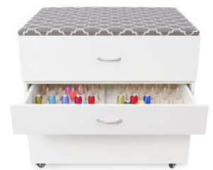
MOD Embroidery Arm Storage Cabinet

Every dream sewing oasis needs its cute, dependable accessories! Add even more convenience with MOD Embroidery Arm Storage Cabinet - featuring dedicated storage for your embroidery machine, a built-in ironing board and expansive thread drawers! Your dream sewing space won't be the same without it!