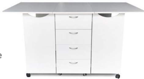
Kookaburra Cutting Table

Kangaroo sewing cabinet - check! Now complete your studio with Kangaroo storage and cutting furniture, specially designed to complement your primary workstation. With extra storage and workspace, you can customize your sewing room to be stylish, comfortable, and even more productive!