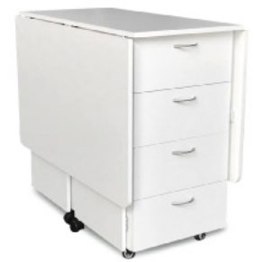
Kookaburra Cutting Table

Every dream sewing oasis needs functional, dependable accessories! Add even more convenience with a cutting table like Kookaburra , featuring two fold out leaves, four self-closing drawers, four rear removable shelves, and locking casters for easy mobility! Your dream sewing space won't be the same without it!