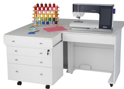
Kangaroo & Joey II Sewing Cabinet

Kangaroo sewing cabinet - check! Now complete your studio with Kangaroo storage and cutting furniture, specially designed to complement your primary workstation. With extra storage and workspace, you can customize your sewing room to be stylish, comfortable, and even more productive!