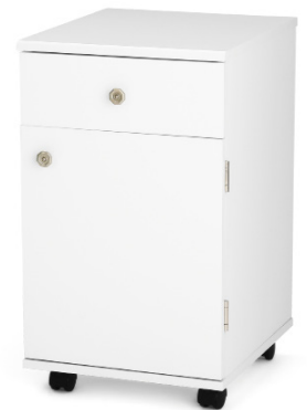
Suzi Storage Cabinet

There can never be too much storage space in your sewing room! Arrow's dedicated storage cabinets are designed for organization and accessibility. Arrow's Suzi , features 4 dedicated storage drawers and comes in Oak and White finishes! Cute and functional!