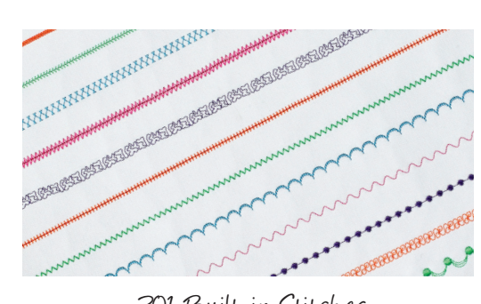
301 Built-in Stitches With 301 built-in stitches, you'll have many creative options. From numerous utility stitches to decorative ones, you'll find something for every project.