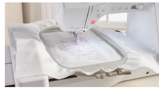
6^{1}/4" \times 10^{1}/4" Embroidery Field Stitch bigger embroidery designs and enjoy less re-hooping with a large embroidery field -6 1/4" x 10 1/4".