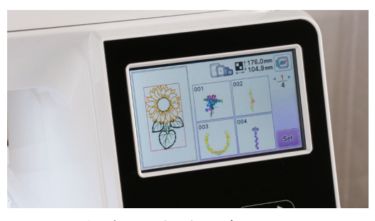
293 Built-in Embroidery Designs With 293 built-in embroidery designs, you'll always find inspiration in the Vesta.