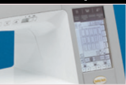
LCD Touch Screen (240 x 320 size) with touch pen The easy-to-read touch screen makes

accessing your machine's settings, editing, and designs simple.