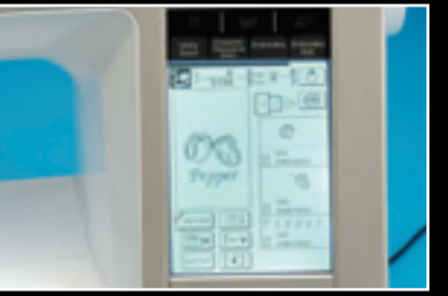
Embroidery Editing On-Screen Instead of measuring and drawing each piece of your designs individually, the Esante allows you to rotate, re-size, and combine all of your designs on-screen before you begin your project.

Embroidery Lettering The Esante allows you to easily arrange your text as well as combine it with your designs on-screen. With 9 font styles to choose from, including one exclusive script, your lettering can be as unique as your designs!