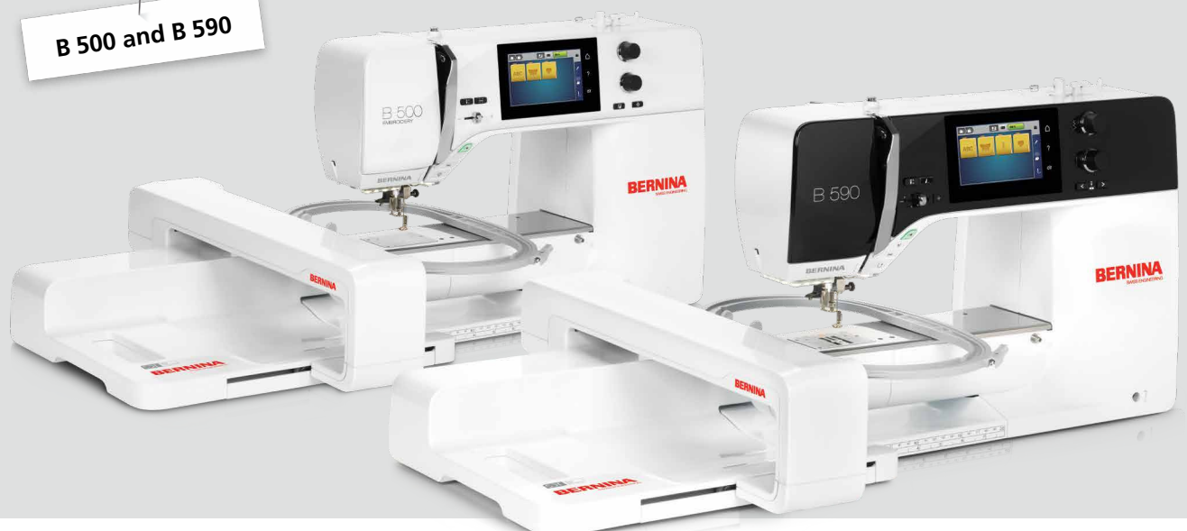
B 500 and B 590

What do wildly-talented cosplayers love about the B 590? Everything. It's faster than their looming deadlines. It's powerful enough for crazy materials. And its embroidery capabilities are absolutely amazing. Cosplayers love this machine and so will you!