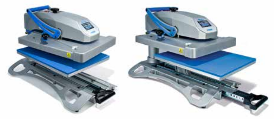
The World's Only Swinger/Draw Design

One or more patent and/or patents pending.