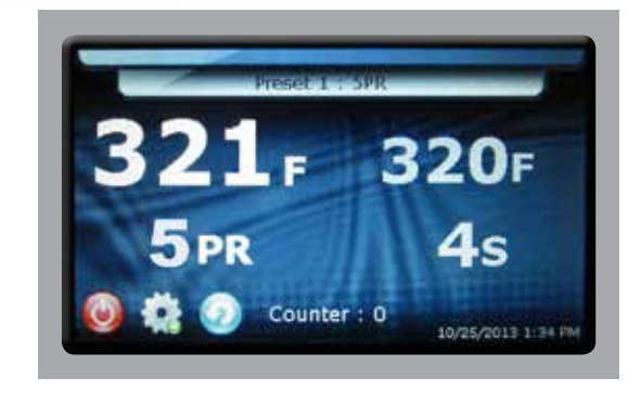
Touch Screen Technology