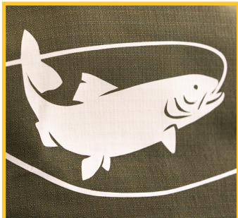
CAD-CUT® Heat Transfer Vinyl