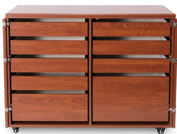
Dingo Cutting Table

Kangaroo sewing cabinet - check! Now complete your studio with Kangaroo storage and cutting furniture, specially designed to complement your primary workstation. With extra storage and workspace, you can customize your sewing room to be stylish, comfortable, and even more productive!