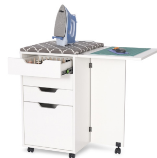
Kiwi Storage Cabinet

Every dream sewing oasis needs its cute, dependable accessories! Add even more convenience with a storage cabinet like Kiwi, featuring a built-in ironing board, cutting mat, thread drawers and a dedicated drawer to store your iron! Your dream sewing space won't be the same without it!