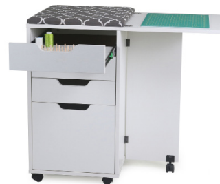
Kiwi Storage Cabinet

Every dream sewing oasis needs its cute, dependable accessories! Add even more convenience with a storage cabinet like Kiwi, featuring a built-in ironing board, cutting mat, thread drawers and a dedicated drawer to store your iron! Your dream sewing space won't be the same without it!