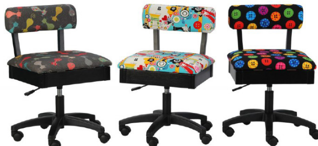
Cat's Meow, Sew Wow Sew Now & Bright Buttons Chairs

The cherry on top of your sewing sundae! Arrow's #1 Rated Height Adjustable Sewing Chair is a must have accessory for your dream sewing room! Cute, comfortable and convenient - our lovable chairs feature vibrant sewing themed patterns, 360° swivel access and lumbar support for long hours at your workstation. Don't look now, but under every seat cushion is a hidden storage compartment to store your notions and patterns! Available in 10 colors to perfectly match your sewing sanctuary!