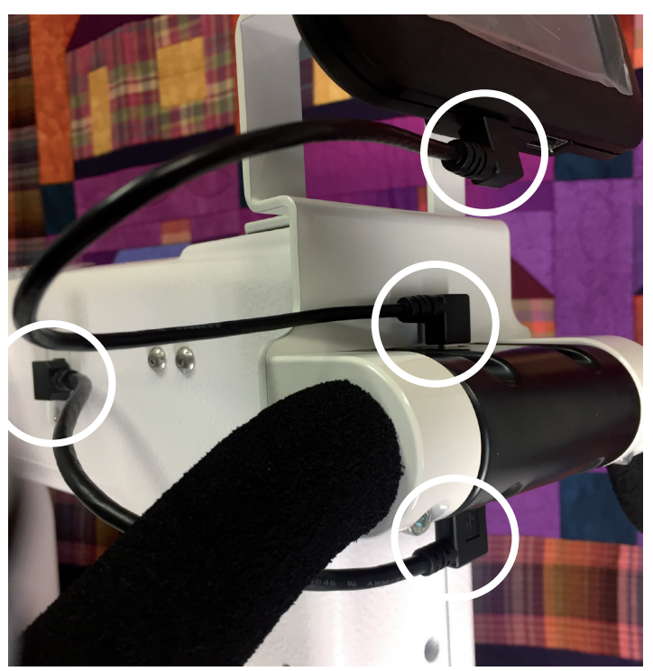
Top cable: handlebar to display QM23010; Bottom cable: handlebar to machine QM23011.

Basic front handlebar connection: The top cable is the QM23010 mini USB cable connecting the handlebar to the display. The bottom cable is the QM23011 large USB handlebar to machine connection cable.