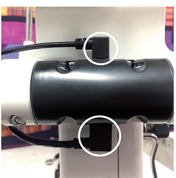
Top cable connector is small and goes to the display. Bottom cable is large and goes to the machine.

Bottom Cable: Front handlebar, the large USB connection on bottom of the handlebar goes to the side of the machine.