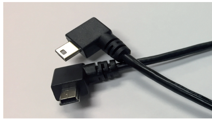
QM23010 Handlebar to Display Connection Cable

Handlebar to Display Connection Cable, mini USB 90 degree to mini USB 90 degree..