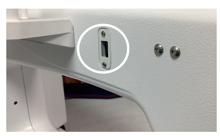
Machine large USB connection for front handlebar large connector

The machine connection is found on the side opposite the top tension assembly on the machine and is just in front of the spool support tray.