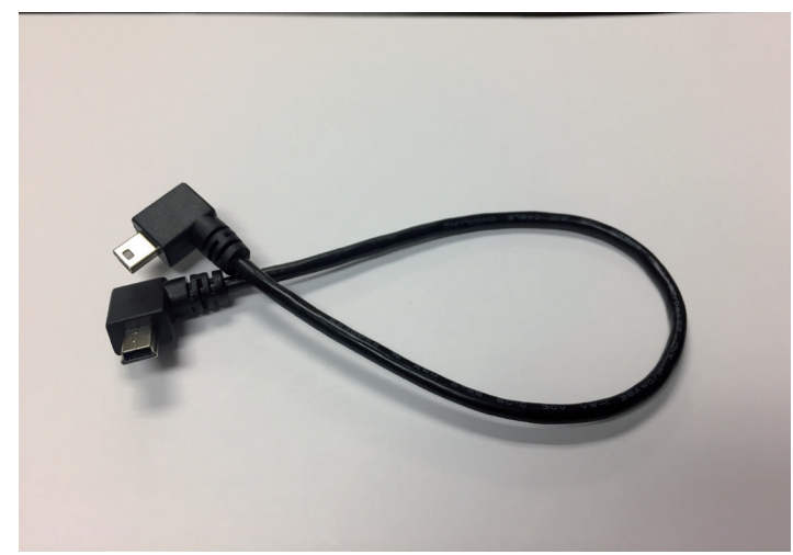
QM23010 Top cable: display to handlebar cable, mini USB 90 degree to mini USB 90 degree.