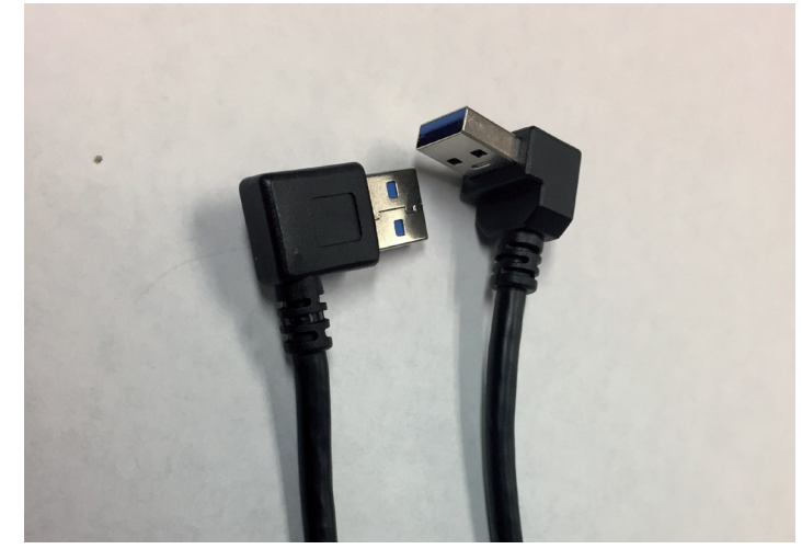
QM23011 bottom cable: handlebar to machine cable, large USB connection, 90 degree to right angle.