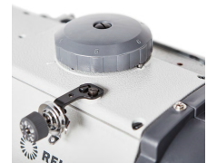
FOOT HEIGHT ADJUSTER