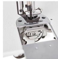
VERTICAL BOBBIN LOAD