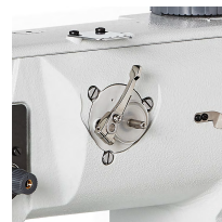
AUTOMATIC BOBBIN WINDER