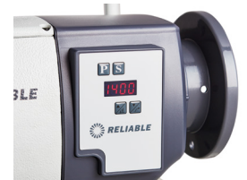
DIRECT DRIVE MOTOR