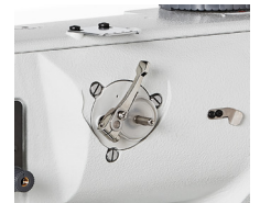
AUTOMATIC BOBBIN WINDER