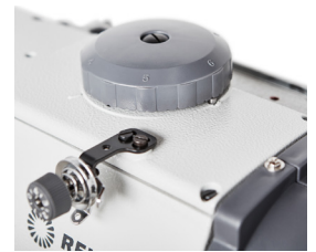
FOOT HEIGHT ADJUSTER