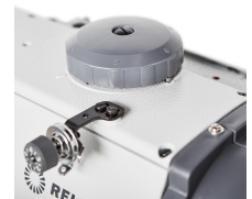
FOOT HEIGHT ADJUSTER