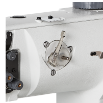
AUTOMATIC BOBBIN WINDER