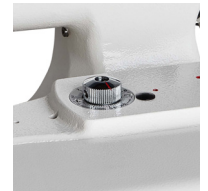
ADJUSTABLE NEEDLE DEPTH