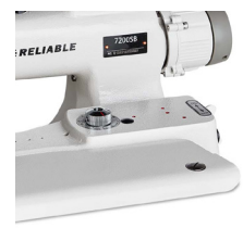
REMOVABLE SWING ARM