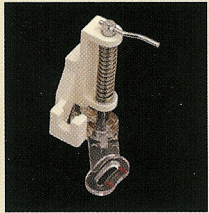
Free-motion Quilting Foot